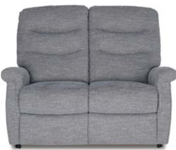
FIXED OR PETITE FIXED AND RECLINING 2 SEAT SETTEE