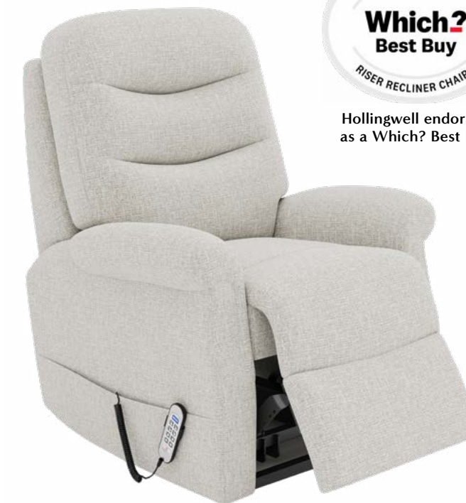
Hollingwell Fabric: Eden Silver

Hollingwell endorsed as a Which? Best Buy