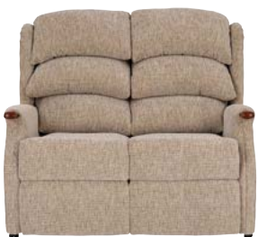
FIXED 2 SEAT SETTEE