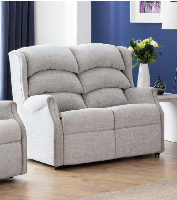
Fabric: Kira Stone.

Westbury models are also available without a knuckle