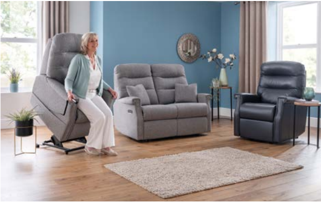
Fabric: Aquaclean Soul Slate.

The Celebrity Aquaclean range is available on all models. Aquaclean® technology is a revolutionary fabric treatment that allows you to clean stains using water only. This provides you with simple fabric maintenance in the minimum amount of time.