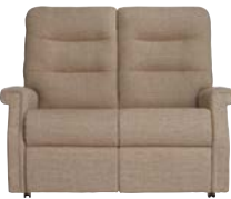
FIXED OR RECLINING 2 SEAT SETTEE