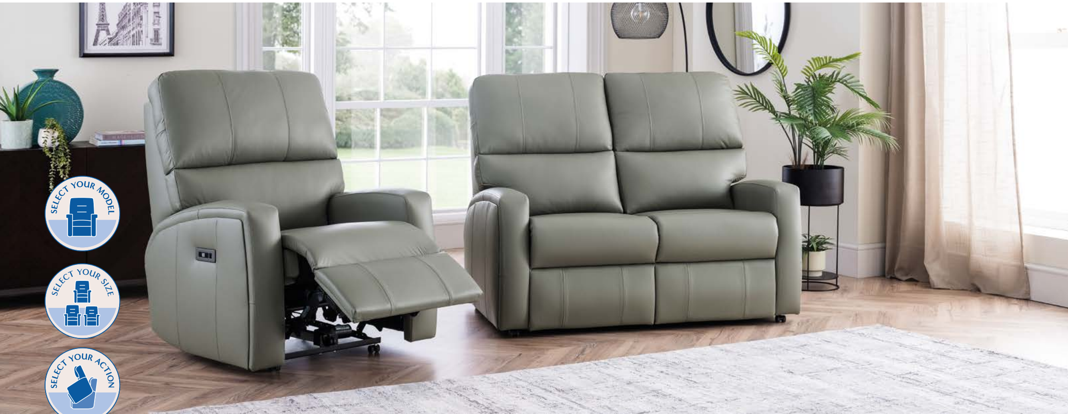
Leather: Ascot Tuscan.