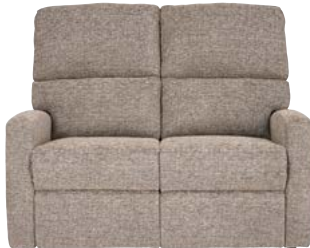
FIXED OR RECLINING 2 SEAT SETTEE