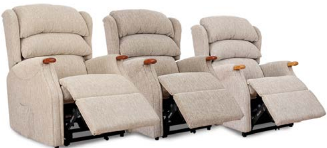
GRANDE STANDARD PETITE