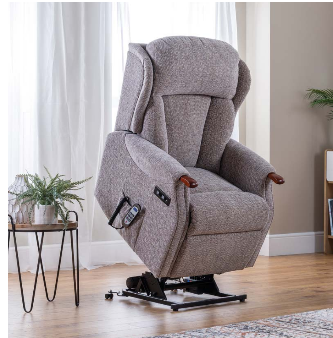
Canterbury Fabric: Dalby Moss

All 3 Tailored-to-fit sizes of the Hollingwell and Canterbury Recliner chairs are available on our super-fast delivery service in either Dalby Moss or Eden Silver fabrics, with teak knuckles only.