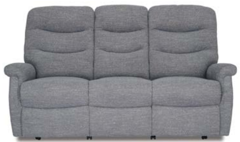
FIXED OR PETITE FIXED AND RECLINING 3 SEAT SETTEE