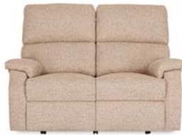
FIXED OR RECLINING 2 SEAT SETTEE