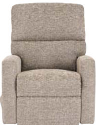
STANDARD FIXED CHAIR