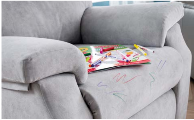
Fabric: Aquaclean Bison Silver.

All Celebrity Aquaclean fabrics have Safe Front®, providing added protection from viruses and bacteria. Aquaclean components also limit the penetration of viruses and bacteria into the fabric. Safe Front® protects against mites and prevents proliferation. This totally eco-friendly shield helps to prevent agents that cause most types of allergies.