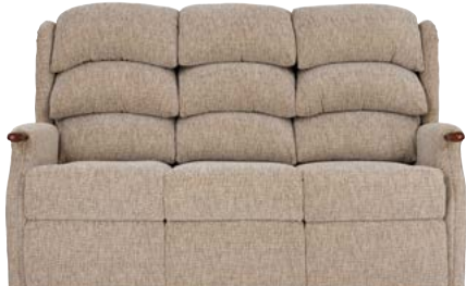
FIXED 3 SEAT SETTEE