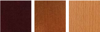
MAHOGANY TEAK NATURAL

A choice of Natural, Teak or Mahogany wood colours. Wood is a natural product therefore colours will vary slightly.