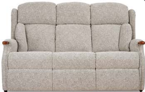
FIXED 3 SEAT SETTEE