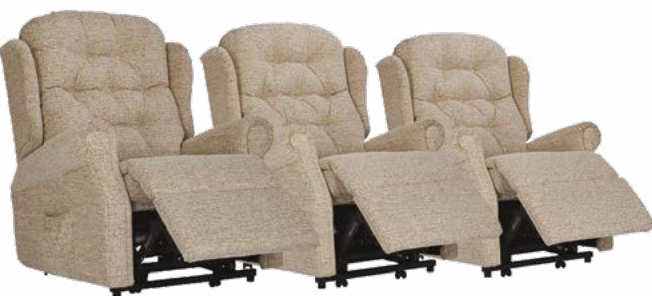
ZIP GRANDE ZIP STANDARD ZIP PETITE

Fabric: Byron Mocha. Woburn scatter cushions are an optional extra.