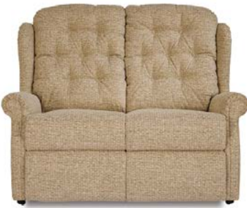
FIXED OR RECLINING 2 SEAT SETTEE