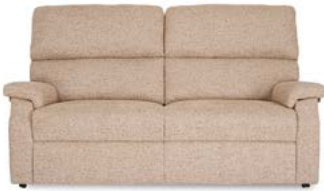
FIXED OR RECLINING 3 SEAT SETTEE