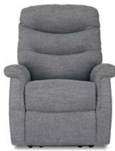
STANDARD AND PETITE FIXED CHAIR

The range includes 3 ‘Tailored-to-Fit’ recliner sizes, Grande, Standard and Petite, all designed to maximise comfort and support. These recliners are available in up to 5 actions.