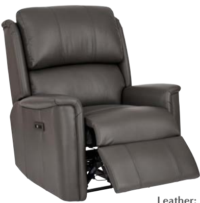
Leather: Ascot Thunder.