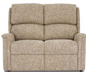
FIXED OR RECLINING 2 SEAT SETTEE