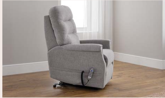
Sandhurst: Fabric Avon Silver.

All exceeding severe contact which is 40,000 Martindale. Martindale is a measure of a fabric's durability based on the rub testing. All other Celebrity fabrics have 20,000 Martindale. Whyburn 40,000 Martindale Derwent 50,000 Martindale *also is a Pet Friendly Fabric. Avon 90,000 Martindale.