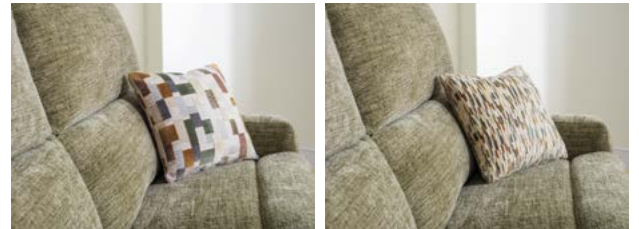
Cushion fabric: Urban Cubic. Cushion fabric: Urban Mosaic.

Scatter cushions are available in any Celebrity fabric. Urban Mosaic and Urban Cubic are available as scatter fabrics only.