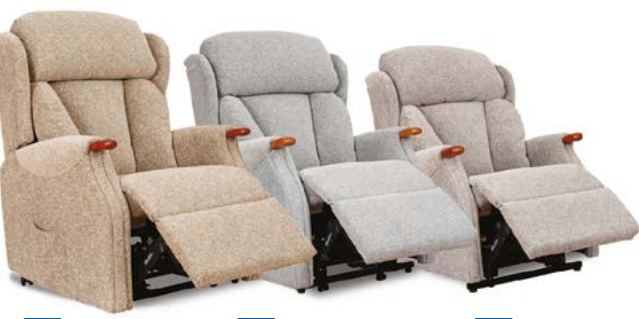
ZIP GRANDE ZIP STANDARD ZIP PETITE

Canterbury 2 and 3 seat split fixed settees have removable backs for ease of delivery. All models are available in any Celebrity fabric or leather.