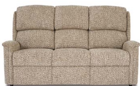
FIXED OR RECLINING 3 SEAT SETTEE