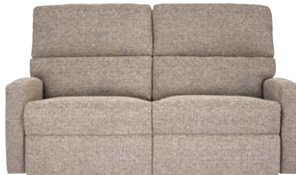
FIXED OR RECLINING 3 SEAT SETTEE

The range includes 3 'Tailored-to-Fit' recliner sizes, Grande, Standard and Petite, all designed to maximise comfort and support. These recliners are available in up to 5 actions.