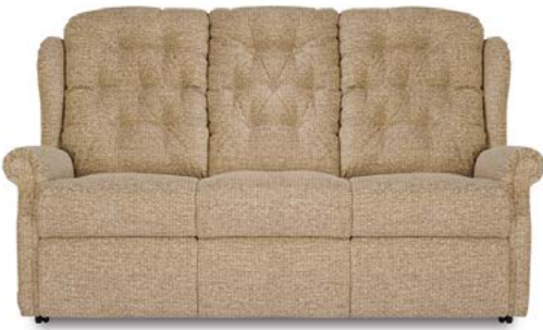
FIXED OR RECLINING 3 SEAT SETTEE