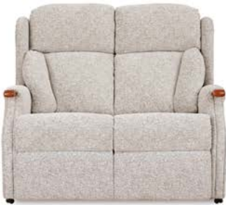
FIXED 2 SEAT SETTEE