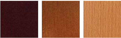
MAHOGANY TEAK NATURAL

A choice of Natural, Teak or Mahogany wood colours. Wood is a natural product therefore colours will vary slightly.