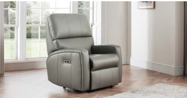
Leather: Ascot Tuscan.