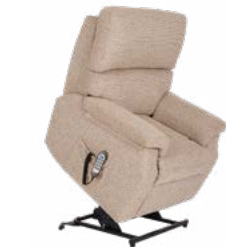
STANDARD The standard size recliner chair is available in all 5 actions.