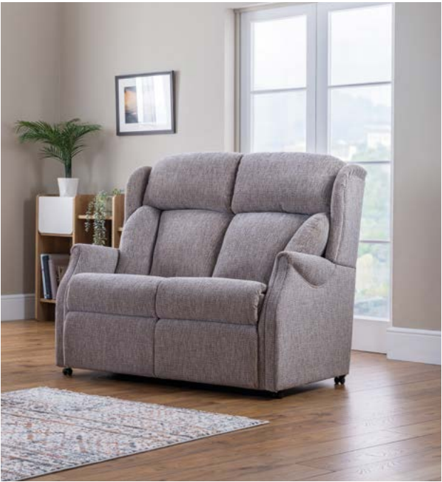
Fabric: Dalby Moss.

Fabric: Bliss Natural. Canterbury scatter cushions are an optional extra.