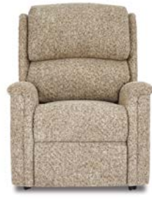
STANDARD FIXED CHAIR