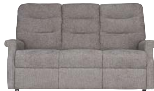
FIXED OR RECLINING 3 SEAT SETTEE